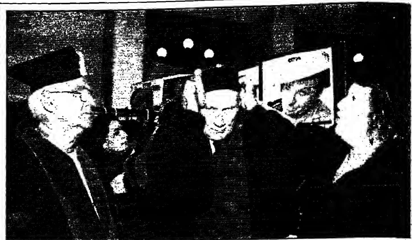
His honor is honored

Edelstein pointed out the ministry had particular success with a job fair aimed at attracting Israelis living in the US to return home, with some 1,000 expected to do so soon.